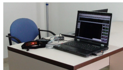
Figure 1 HEG device. Abbreviation: HEG, hemoencephalography.

Evaluation was made individually for each subject by a single researcher, and always the same researcher, in an isolated and properly conditioned room. The brain activity was recorded at the Fpz electroencephalographic point. At the beginning, a 30-second HEG record was registered to establish the baseline (minimal mental activity). To do this, each subject was asked to close his eyes and visualize the number 1, thus obtaining a homogeneous baseline measurement in all study subjects.