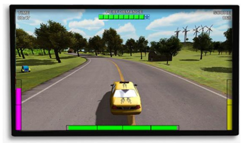
Fig. 1. The shrinking screen was presented during neurofeedback (alfa/theta coherence) session as a confounding factor . http://zukor.com/interactive/

Zukor's Drive also includes all the standard features of Zukor feedback games, such as profiles, scores, auditory feedback, period/session length presets and more. It is Zukor Interactive's most ambitious feedback game and is certain to focus your clinical patients and engage those undergoing peak performance training.